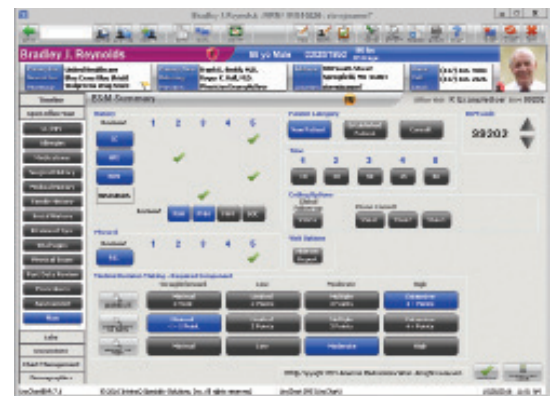
Evaluation and Management